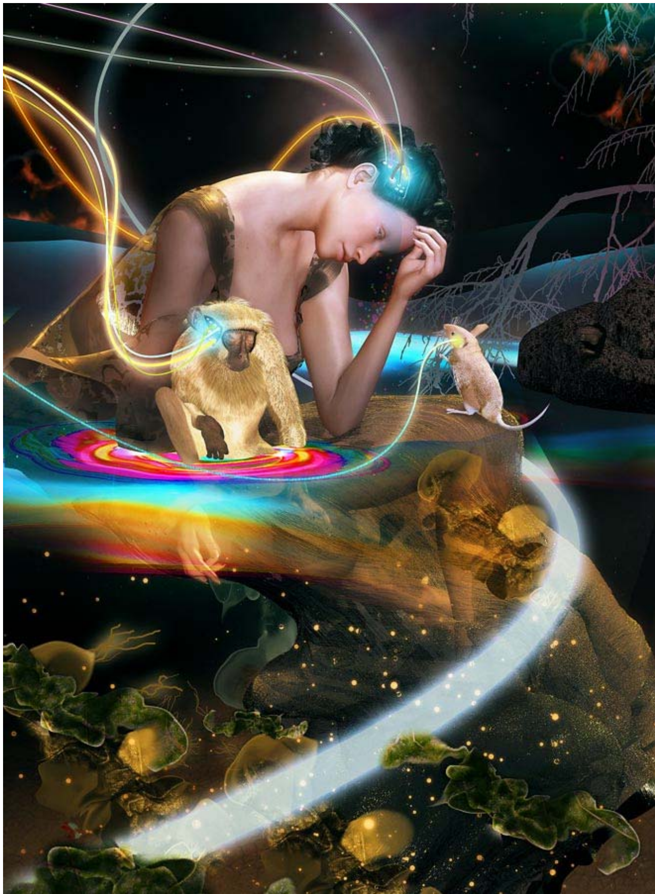
Illustration: Justin Wood

In the summer of 2007 , a team of Stanford graduate students dropped a mouse into a plastic basin. The mouse